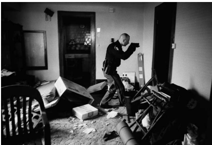
Figure 1. Cleveland, Ohio, 26 March 2008 (Cleveland, 2008).