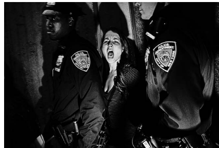
Figure 2. Harlem, New York, USA, 21 October 2011 (New York, 2011).