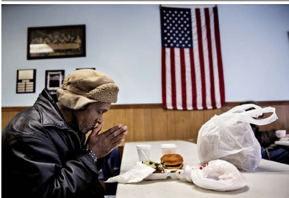
Figure 3. At the Dining Hall, 12 October 2012 (Youngstown, Ohio, 2012).